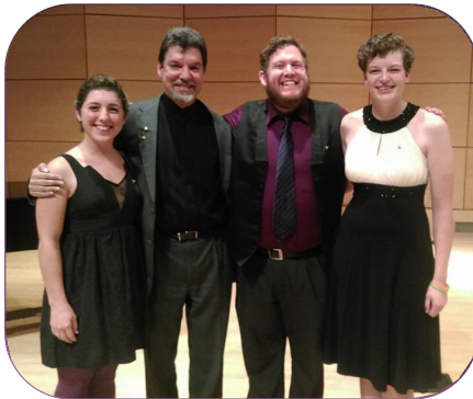
Left: Alumni and Advisors at Winter Concert!