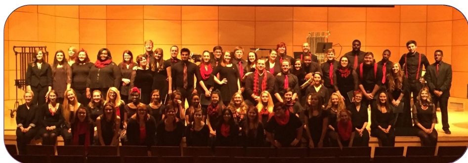
Above: RU Choral Ensembles